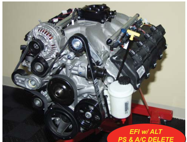
EFI w/ ALT PS & A/C DELETE INSTALLED