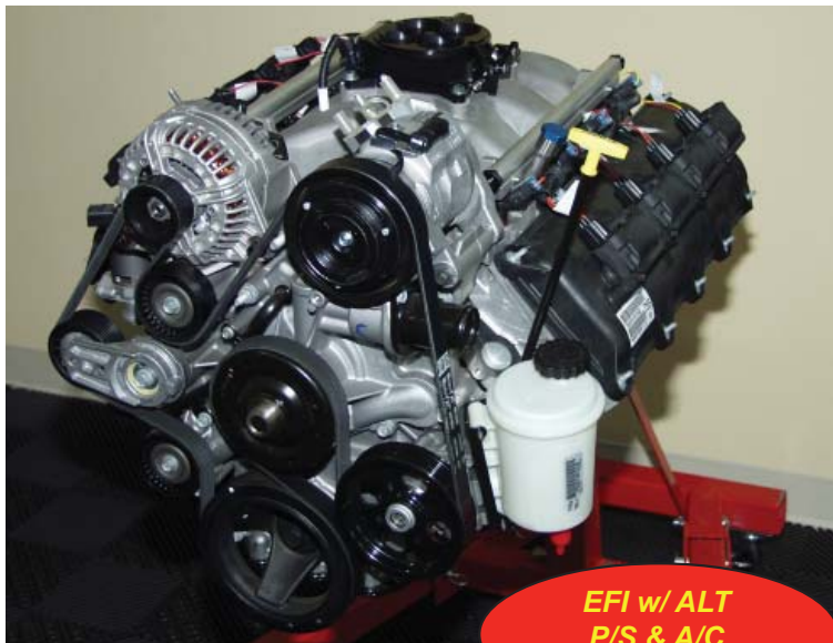
EFI w/ ALT P/S & A/C INSTALLED